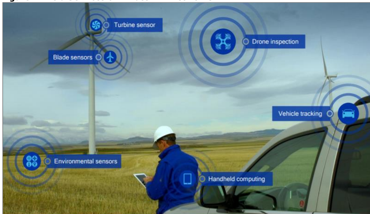
Figure 2: Field Services & Private LTE Networks

In Figure 2 , a wind farm operator uses wireless connectivity to improve the efficiency of its turbines and associated field operations. Low-power sensors are deployed on the turbine to monitor operating performance and for predictive maintenance alerts (especially useful for offshore wind farms). High-speed mobility is needed for drone-mounted video cameras. Employee connectivity and vehicle tracking are also supported.